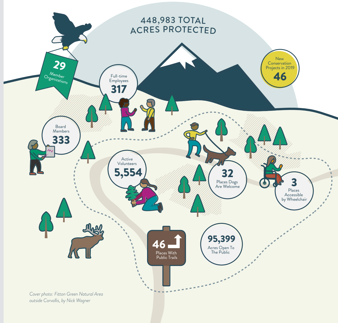
Cover photo: Fitton Green Natural Area outside Corvallis