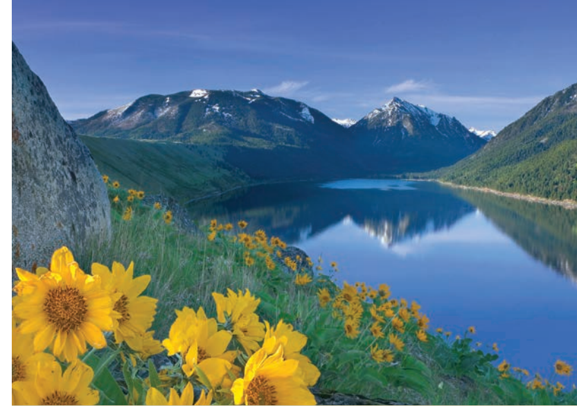
Above: Wallowa Lake